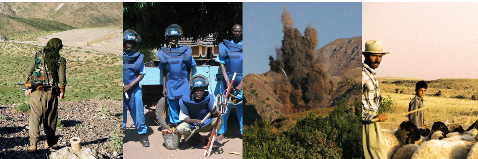
Geneva Call and the Program for the Study of International Organization(s), Geneva, 2007 ©