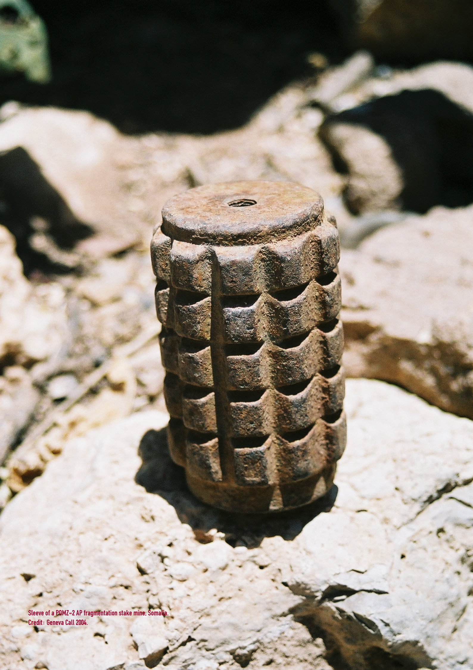
Sleeve of a POMZ-2 AP fragmentation stake mine, Somalia.