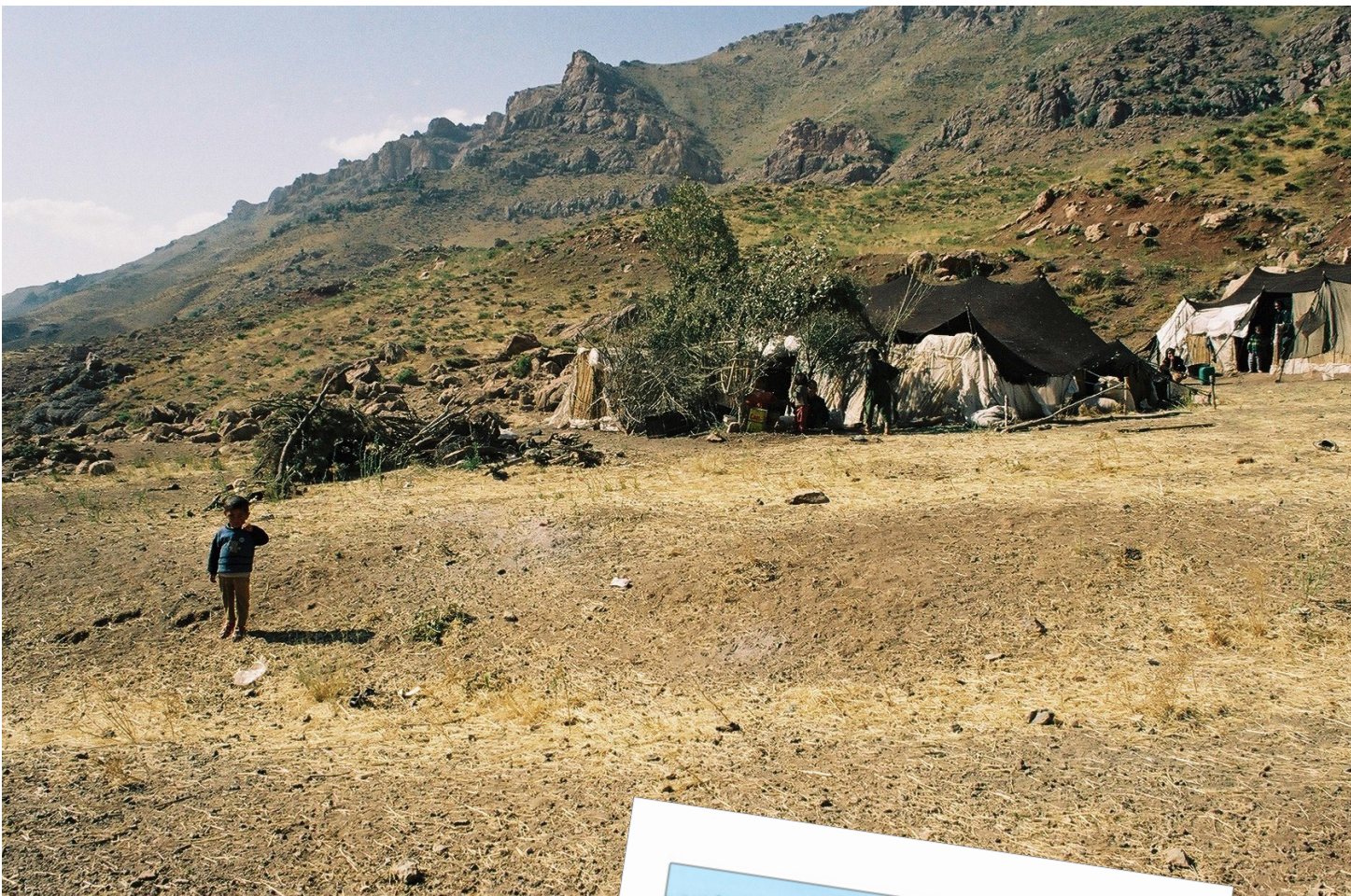
The civilian population is the principal beneficiary of humanitarian engagement with NSAs.

The above factors are meant to facilitate the analysis of engagement with NSAs on humanitarian or human rights norms. The following chapter discusses the findings of the two reports on NSA involvement in mine use and mine action, from which many of the listed observations were drawn.