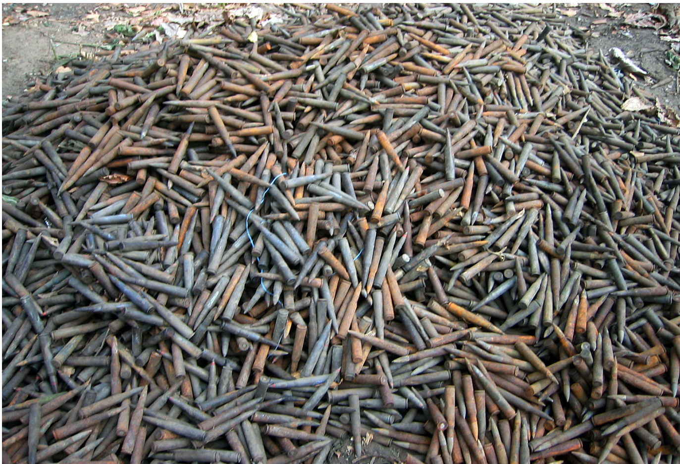
Ammunition rounds, South Sudan.

In this chapter, it has been shown that some of the findings from the NSAs and landmines project could also be useful for the study of NSA involvement in the small arms problem, both in negative (misuse) and positive (measures taken to improve protection or decrease misuse) terms. The following chapter summarizes the main findings of the report and presents some recommendations elaborated to improve mine action efforts with NSAs.