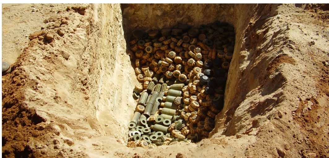
Mines belonging to an NSA, prepared for destruction.

The chapter that follows discusses how the findings here summarized could apply to other issues that constitute human security threats, exemplified by the issues of child soldiers and small arms and light weapons.