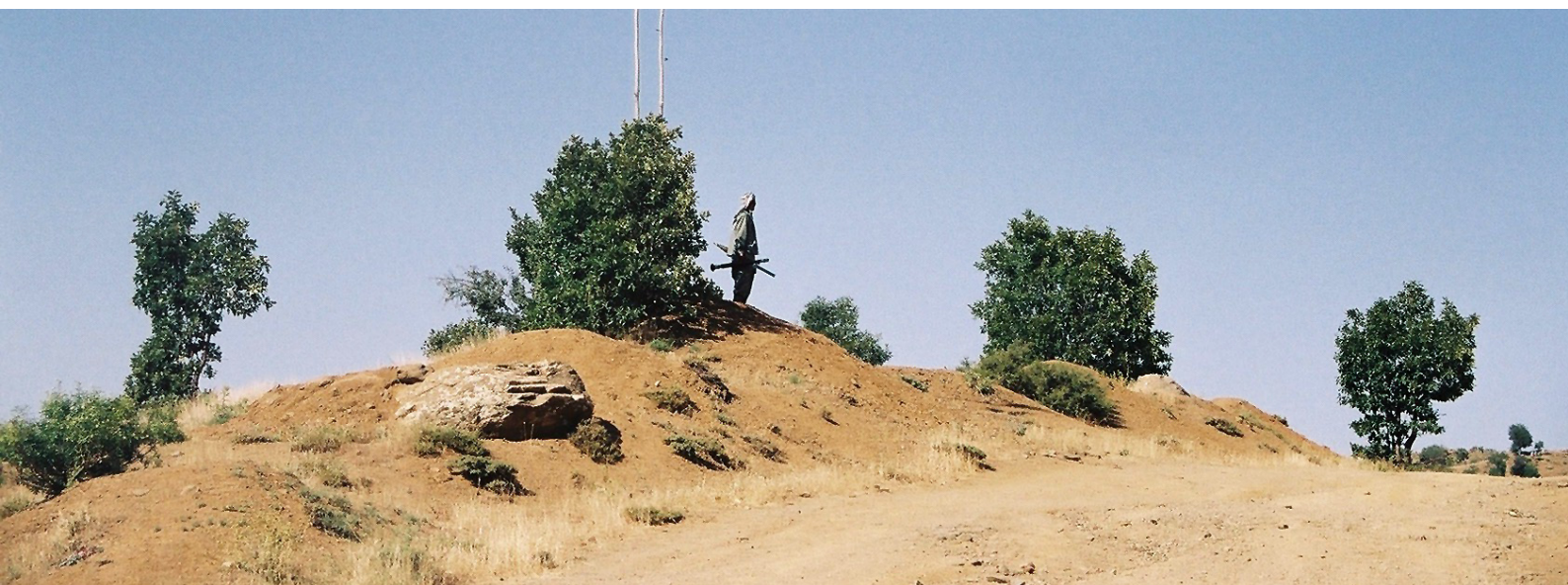
NSA soldier on watch.

There are numerous engagement options available: who should engage, how and with whom? 53 Different approaches for engagement have been identified, for example by Policzer and Capie, 54 Policzer and Manikkalingam, 55 the ICRC, 56 the International Council on Human Rights Policy, 57 and Conciliation Resources, 58 among others. Authors have identified the main actors that may be involved in engagement processes with NSAs as NGOs (humanitarian or human rights), 59 States or their different agencies, and international or regional organizations. 60 In 2000, David Petrasek created a framework for putting engagement with armed groups and questions of human rights violations in a wider perspective. The framework highlights the interconnectedness between the character of the armed group, the role of the host State, and the strengths and weaknesses of NGOs, 61 and recognized the need for different NGOs to take different approaches to armed groups, depending on their needs and the security situation of their collaborators. 62 He also identified three significant constituencies of NSAs that may have an impact on their behavior: local populations, refugee communities or internally displaced persons (IDPs), and diasporas. 63 Table 1 summarizes some of these approaches, actors and conditions, based on the above mentioned contributions.