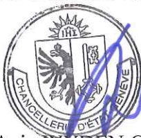
Anja WYDEN GUELPA Chancelière d'Etat

For THE GOVERNMENT OF THE REPUBLIC AND CANTON OF GENEVA