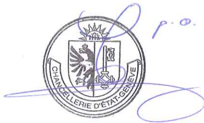
ANJA WYDEN GUELPA Chancelière d'Etat

For the GOVERNMENT OF THE REPUBLIC AND CANTON OF GENEVA