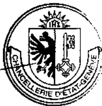
ROBERT HENSLER Chancelier d'Etat

Received for the Government of the Republic and Canton of Geneva on the 10 day of September , 2002 by: