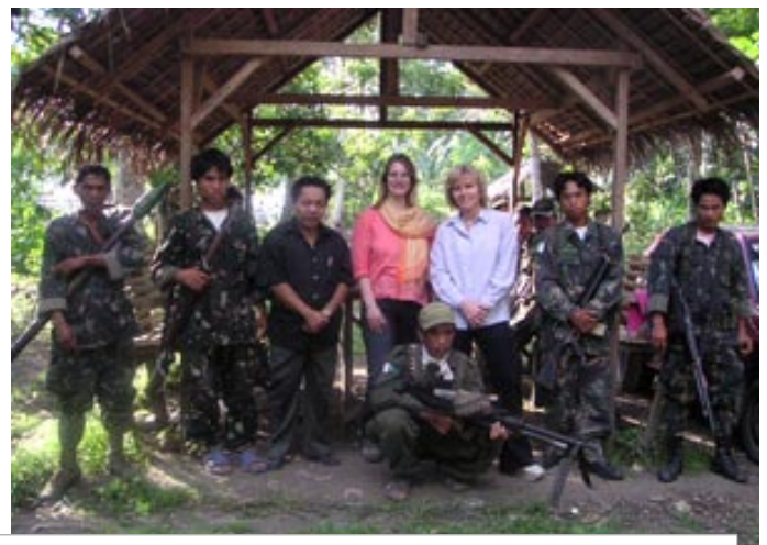
[Photo] Geneva Call staff with members of the MILF, after a meeting with their leaders.